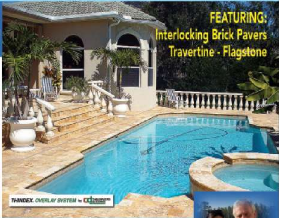
THINDEX OVERLAY SYSTEM by ccd

Licensed * Bonded * Insured * ICPI Certified * Veteran Owned